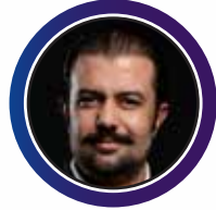
Khurram Schehzad Advisor to Finance Minister, GOP